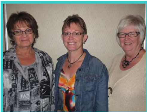
Our Staff and